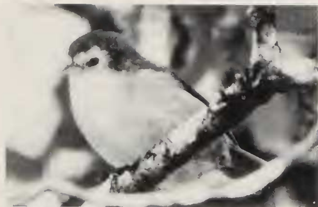
FIG. 7. Juvenile 'Akikiki ( Oreomystis bairdi ) showing distinctive white "spectacles," Alaka'i Swamp, 1975.

Swamp Trail, the most reliable locality outside the preserve (Pratt 1993). Recently, 'Akikiki have again been found in encouraging numbers along the Mohihi-Waiālae Trail (Pyle 1996). Appropriately, the 'Akikiki is being considered for listing as an Endangered Species (T. Pratt, pers. comm.).